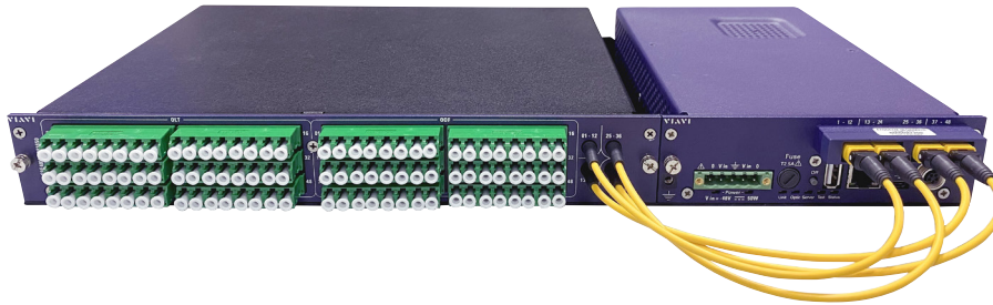
OTU-5000 with a 48 port (Test Access Point) TAP and 48 port MPO switch